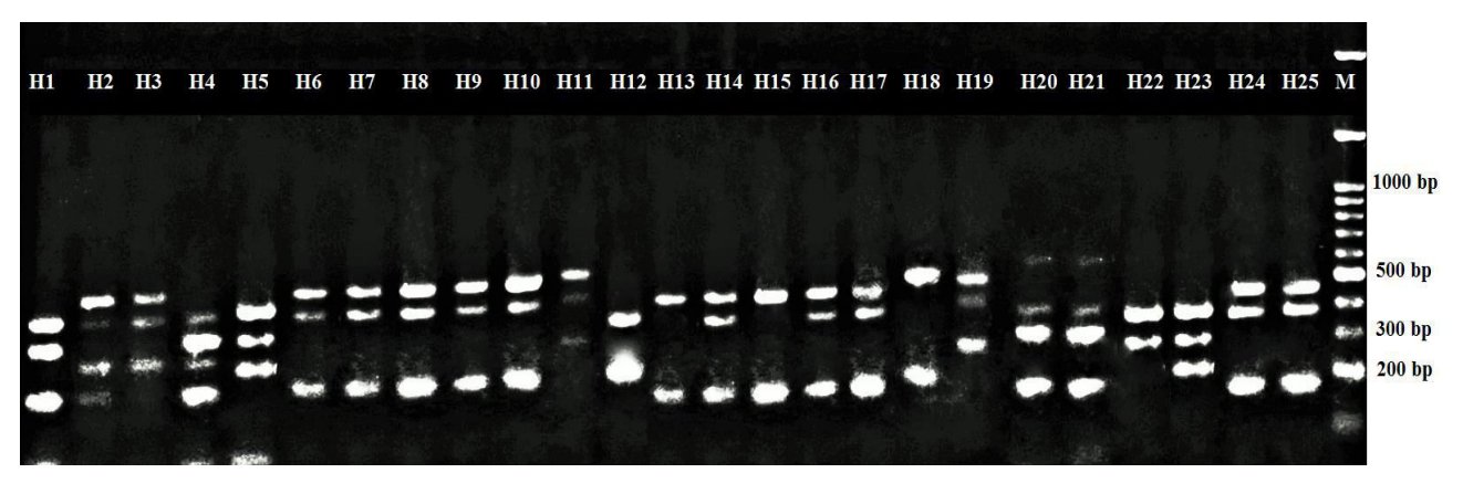
Fig. 1: coa -PCR-RFLP results of the S. aureus isolates obtained from human samples. Lane M: 100 bp DNA marker. Lanes H1-H25: AluI digestion of coa gene of 25 human S. aureus isolates