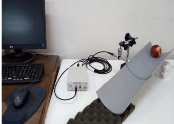
Fig. 1. Experimental setup

the middle of path with a step height of 4 mm. A microphone was installed a few millimeters away from the surface of the plate adjacent to the step for recording sound signals while apples were rolling down. The acoustic signals were recorded using BSWA equipment and included a data acquisition system (Model MC3022) and one microphone (Model MA231).