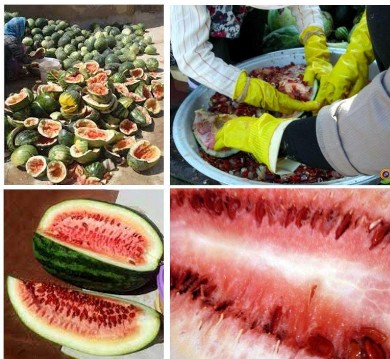
Fig. 1. A variety of watermelon cultivated primarily for its large, edible seeds, with the pulp being less commonly consumed, and Manual separation of watermelon seeds from the pulp.