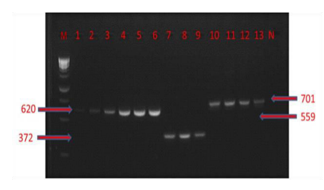
Fig. 3: Gel electrophoresis image of PCR analysis of resistance genes. M: DNA ladder (HyperLadder 1 kb plus/Bioline), and N: Negative control. Lanes 1-3: gyrA gene with 620 bp, Lanes 4-6: tetO gene with 559 bp, Lanes 7-9: blaOXA-61 gene with 372 bp, and Lanes 10-13: aphA-3 gene with 701 bp