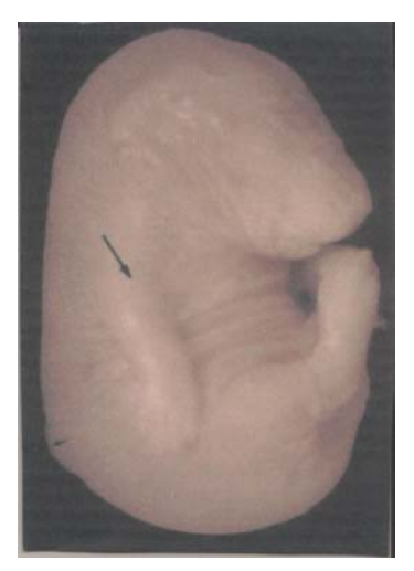
Fig. 3. Abnormal polarity in upper limbs of mouse embryo (arrow), after injecting (IP) 75 and 100 mg/kg of QPPE, on days 10 and 11 of gestation

Fig. 2. Deviation of body axis of mouse embryo (arrow), after injecting (IP) 100 mg/kg of QPPE, on day 9 of gestation