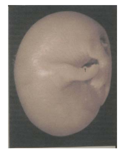
Fig. 1. Lateral view of C-shaped mouse embryo with extra digit (arrow), after injecting (IP) 100 mg/kg of QPPE, on day 10 of gestation