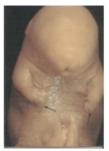
Fig. 6. Syndactily in mouse embryo (arrows), after injecting (IP) 100 mg/kg of QPPE, on day 11 of gestation

Fig. 5. Fissure in lumbar region of mouse embryo (arrow), after injecting (IP) 75 mg/kg of QPPE, on days10 and 11 of gestation