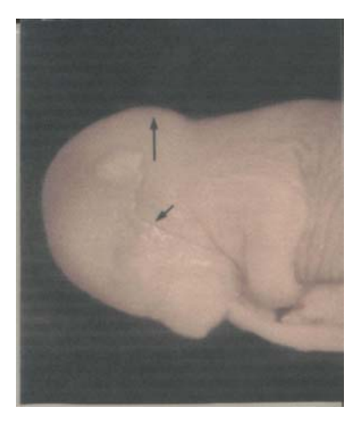
Fig. 4. Abnormal head (scaphocephaly) in mouse embryo (arrows), after injecting (IP) 75 and100mg/kg of QPPE, on days 9, 10 and 11 of gestation