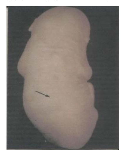
Fig. 2. Deviation of body axis of mouse embryo (arrow), after injecting (IP) 100 mg/kg of QPPE, on day 9 of gestation

Fig. 1. Lateral view of C-shaped mouse embryo with extra digit (arrow), after injecting (IP) 100 mg/kg of QPPE, on day 10 of gestation